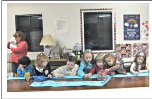
Coloring the Alleuia Banners